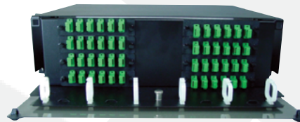
3U 48-96 Ports