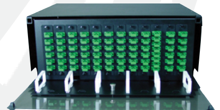
4U 72/96/144 Ports