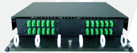
2U 24-48 Ports