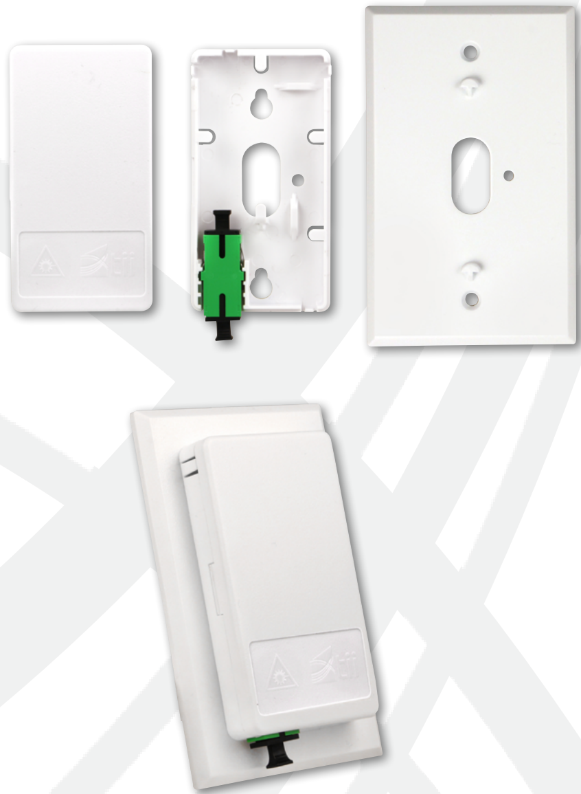
CCP5 / WallPlate Assembly

The CCP5 serves as a single fiber connection/demarcation point and is typically used at the MDU point-of-entry or as the FTTH ONT access point. The unit is directly wall mountable, or may be mounted onto a Single Gang wiring box using an included Wallplate. These enclosures provide a secure location for slack storage and fiber connections.